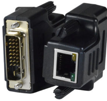
ST-C5DVI-MINI (Local and Remote Unit)