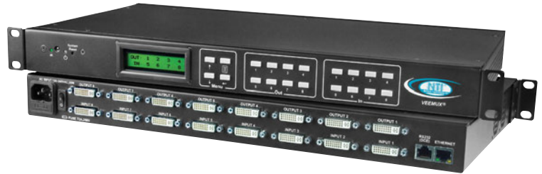
VEEMUX® SM-8X8-DVI-LCD (Front & Back)