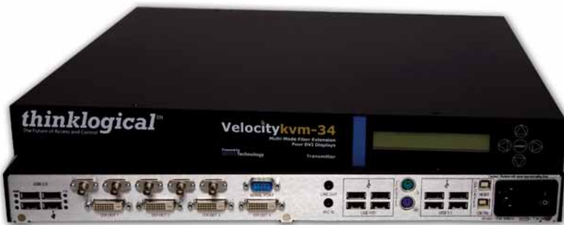
Velocitykvm System - 34, Transmitter and Receiver, Multi-Mode Fiber