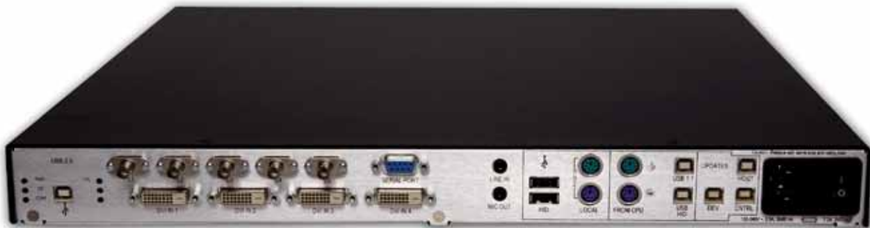
Velocitykvm Extender - 34 Transmitter, Multi-Mode