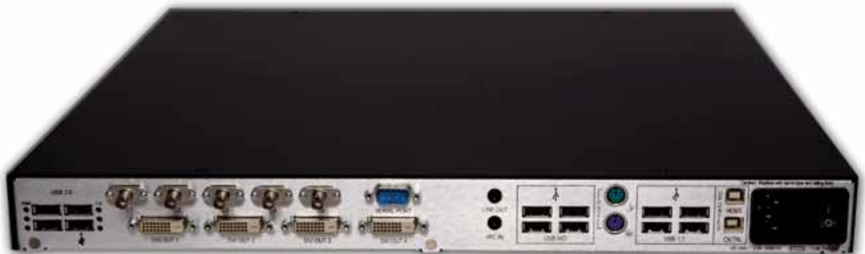
Velocitykvm Extender - 34 Receiver, Multi-Mode