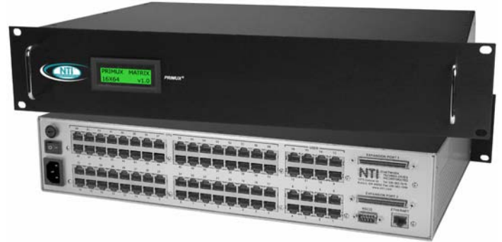
PRIMUMUX-16X64 (Front and Back)

The PRIMUX® KVM Matrix Switch via CAT5 provides non-blocking access for up to 16 simultaneous users to up to 64 servers. The switch frees up valuable space by eliminating large KVM switchboxes and bulky hard-to-manage coax cables.