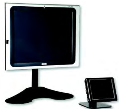
Shown: 5.7" and 17"

Thinklogical also provides users with control touch panels. With several sizes to choose from (5.7", 8.9", and 17"), they provide tremendous flexibility in external routing control. The touch panel simply connects to your network and provides the HDX Configurator interface, in a variety of locations, right at your fingertips.